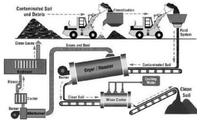
Figure 1. Thermal desorption process for contaminated soil [15].