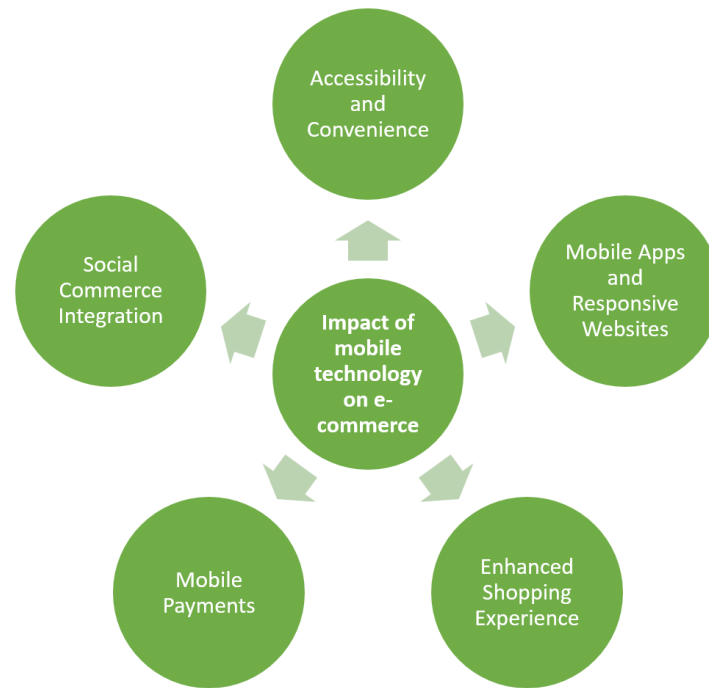
Figure 1. The impact of mobile technology on e-commerce.