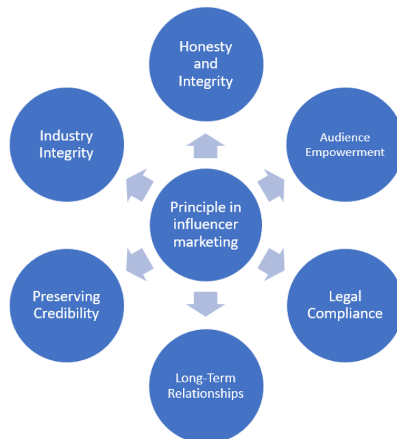
Figure 1. Fundamental principle in influencer marketing and across various digital platforms.

Honesty and integrity or transparent disclosures demonstrate a commitment to honesty and integrity. When influencers openly communicate their relationships with brands and the fact that they have been compensated for promoting a product or service, it creates an atmosphere of trust. This trust is a valuable currency in the influencer-consumer relationship. Transparent disclosures empower audiences to make informed decisions. When audiences can clearly distinguish between organic content and sponsored posts, they can better evaluate the authenticity and credibility of the influencer's message [10]. This empowers consumers to