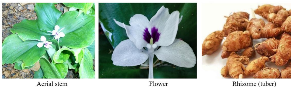
Figure 1. Morphological characteristics of K. galanga in Vietnam.

cm wide, dark green and smooth on the upper surface, with a fine pubescence on the underside [11-13]. The flowers emerge from the rhizomes, are hermaphroditic, and exhibit white petals with a possible purple center. Inflorescences are usually enclosed in leaf sheaths or grow very low near the ground, distinguishing K. galanga from other Zingiberaceae species with tall pseudostems. Flowering primarily occurs from May to July, with the initial bud formation in March. Unlike many species such as Kaempferia rotunda or Alpinia zerumbet , K. galanga exhibits limited leaf color variation, and its leaf morphology is relatively more stable, reflecting its greater value as a medicinal plant rather than as an ornamental species [14]. As illustrated in Figure 1, the characteristic low-growing habit, limited leaf number, and aromatic rhizomatous structure distinguish K. galanga from other Zingiberaceae species with more developed pseudostems, supporting its taxonomic identification and medicinal recognition.